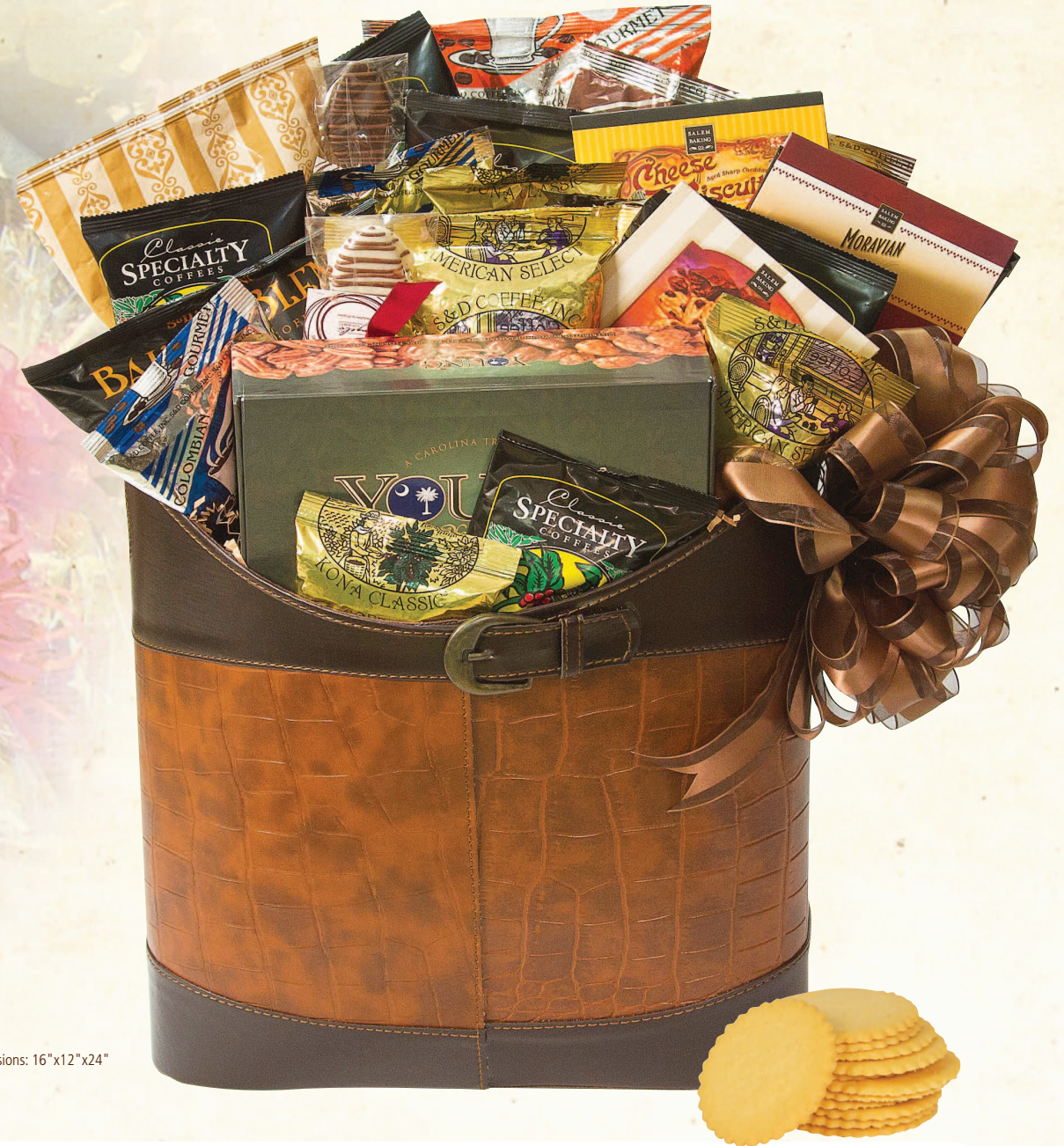
Dimensions: 16" x 12" x 24"