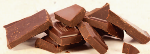
Dimensions: 9" x 8" x 16"

Contains: 1 Chocolate Raspberry 2oz Coffee, 1 Chocolate Irish Cream 2oz Coffee, 1 Bakery Blend 3.25oz Coffee, 1 Colombian Gourmet 1.75oz Coffee, 1 2lb S&D Hot Chocolate, 1 S&D Chocolate Lollie, 1 Box Chocolate Graffiti Zoo, 1 London Mint Chocolate Bar, 1 Chocolate Pretzel, 1 Box Mingo River Pecans