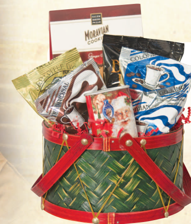
Dimensions: 8"x 8"x 10"

Contains: 1 Kona Classic 1.5oz Coffee, 2.5oz Container of Hot Chocolate, 1 Bakery Blend 3.25oz Coffee, 1 Colombian Gourmet 1.75oz Coffee, 1 Traditional Gourmet 1.5oz Coffee, 1 Cocoa, 1 Box Moravian Cookies