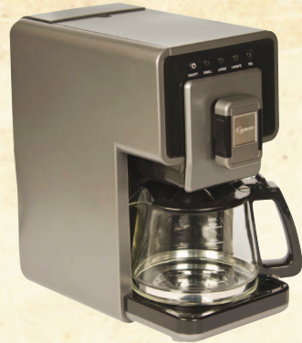
Capresso Coffee A La Carte

Brews a full carafe or an individual custom cup of coffee or tea, using the innovative cup to carafe brewing system. Brews a single cup in 60 seconds or 42oz carafe in less than 6 minutes.