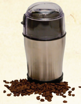
Capresso Stainless Steel Finish Cool Grind Coffee Grinder

This 10-cup coffee maker has a full stainless steel wrapped housing, 24 hour programmable clock timer, gold tone filter, drip stop, and 2-hour safety shut-off.