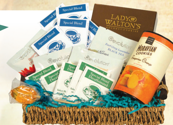
Dimensions: 9" x 6" x 7"

Contains: 5 S&D Regular Hot Tea Packets, 5 S&D Decaf Hot Tea Packets, 1 Earl Grey Tea Packet, 1 Honeybrush Caramel Tea Packet, 1 Tropical Green Tea Packet, 1 Oolong Tea Packet, 1 Honey Spoon, 1 Box Moravian Cookies, 1 Box Lady Walton Cookies