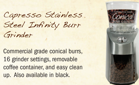
Capresso Stainless Steel Infinity Burr Grinder

Low heat build-up preserves more flavor and aroma. Stainless steel blade grinds from coarse to fine.