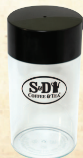
S&D Coffee & Tea Vacuum Canister

The canister will hold up to 1 pound of coffee.