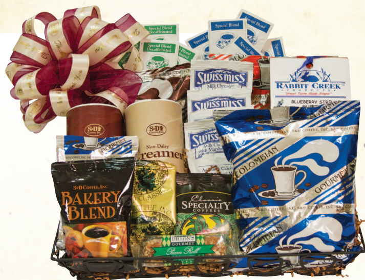
Dimensions: 16" x 12" x 12"

Contains: 1 Colombian Gourmet 14oz Coffee, 1 Colombian Gourmet Decaf 14oz Coffee, 1 Traditional Gourmet 14oz Coffee, 1 Bakery Blend 3.25oz Coffee, 1 Kona Classic 1.5oz Coffee, 1 Kona Decaf 2.5oz Coffee, 6 S&D Regular Hot Teas, 6 S&D Decaf Hot Teas, 1 Sugar Canister, 1 Creamer Canister, 4 Swiss Miss Hot Chocolate Packets, 1 Pecan Roll, 1 Muffin Mix