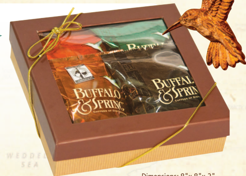
Dimensions: 8"x 8"x 2"

Contains: 1 Marseilles French Roast 2.5oz Coffee, 1 Earth Song 2.75oz Coffee, 1 Colombian Reserve 2.5oz Coffee, 1 Colombian SWP Decaf 2.5oz Coffee