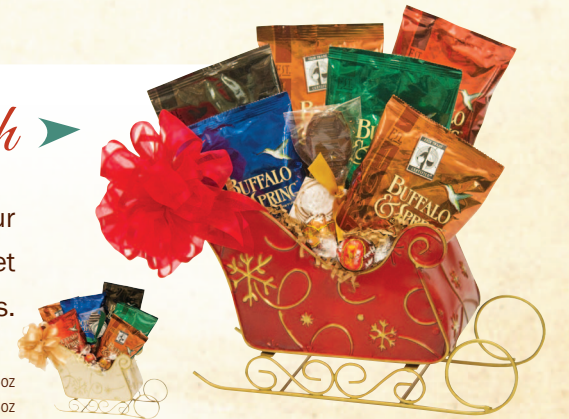
Dimensions: 12"x 8"x 12"

Contains: 1 Guatemala Huehuetenango 2.5oz Coffee, 1 French Vanilla 2.5oz Coffee, 1 Saavian 3.25oz Coffee, 1 Colombian Reserve 2.5oz Coffee, 1 Colombian Reserve Decaf 2.5oz Coffee, 1 Tonga 2.5oz Coffee, 2 Chocolate Lindt Truffles, 1 Chocolate Spoon