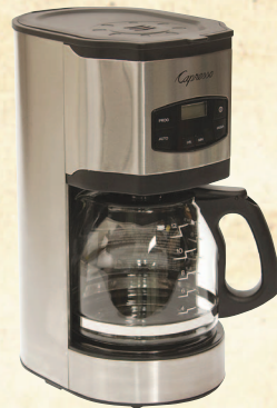
Capresso Stainless Steel Coffee Maker

Brews a full carafe or an individual custom cup of coffee or tea, using the innovative cup to carafe brewing system. Brews a single cup in 60 seconds or 42oz carafe in less than 6 minutes.