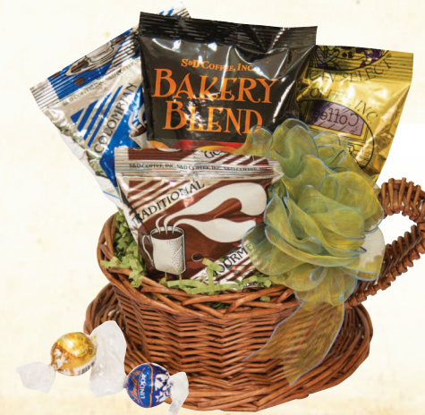
Dimensions: 8" x 7" x 13"

Contains: 1 Traditional Gourmet 1.5oz Coffee, 1 Kona Classic 1.5oz Coffee, 1 Bakery Blend 3.25oz Coffee, 1 Colombian Gourmet 1.75oz Coffee, 2 Lindt Chocolate Truffles