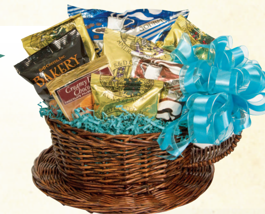
Dimensions: 12" x 11" x 15"

Contains: 1 Colombian Gourmet 14oz Coffee, 1 Bakery Blend 3.25oz Coffee, 2 Kona Classic 1.5oz Coffees, 1 100% Colombian 1.5oz Coffee, 1 Traditional Gourmet 1.5oz Coffee, 1 American Select 2oz Coffee, 1 Box Lady Walton Cookies