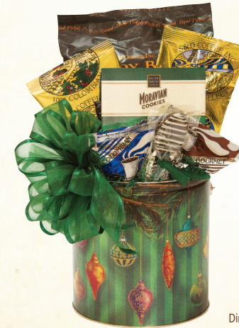
Dimensions: 8"x 8"x 12"

Contains: 1 100% Colombian 1.5oz Coffee, 1 Traditional Gourmet 1.5oz Coffee, 1 Colombian Gourmet 1.75oz Coffee, 1 European Select 1.5oz Coffee, 1 Bakery Blend 14oz Coffee, 1 Box Moravian Cookies, 1 Chocolate Spoon