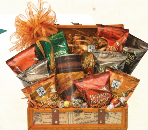
Dimensions: 12"x 8"x 12"

We've left no coffee cherry unpicked in this delightful container of coffees. Designed to satisfy every coffee drinker, we've included a selection of blends and varietal coffees from our Buffalo & Spring® line.