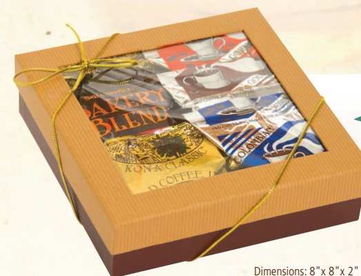
Dimensions: 8" x 8" x 2"