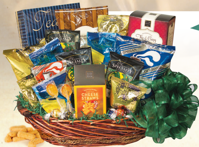
Dimensions: 20" x 12" x 13"