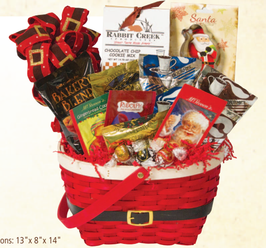
Dimensions: 13"x 8"x 14"

Contains: 1 Bakery Blend 3.25oz Coffee, 1 100% Colombian 1.5oz Coffee, 1 European Select 1.5oz Coffee, 1 Colombian Gourmet 1.75oz Coffee, 1 Traditional Gourmet 1.5oz Coffee, 1 Box Cookie Mix, 3 Packets Gourmet Hot Chocolate, 1 Cookie Cutter, 3 Chocolate Lindt Truffles