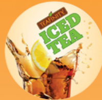
3" X 3" BUTTON