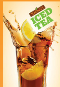
4" X 6" TABLE TENT