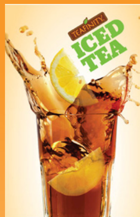
11.5" X 17.5" WINDOW POSTER