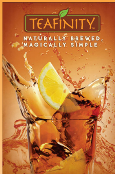
24" X 36" A-FRAME SIGN