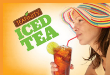
7" X 5.5" BREWER SIGN