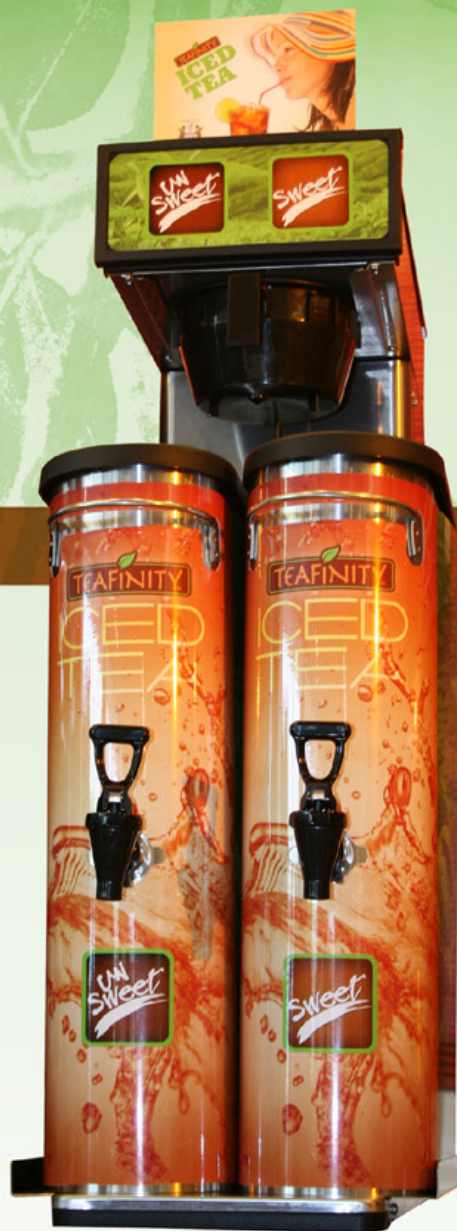
The equipment can also be preset to any volume: by the cup, by the pitcher or by the dispenser, demonstrating more versatility than you get from fresh brewing systems.

The Teafinity Natural Brewed Iced Tea with the BrewMaster System looks just like a traditional fresh brewed iced tea system.