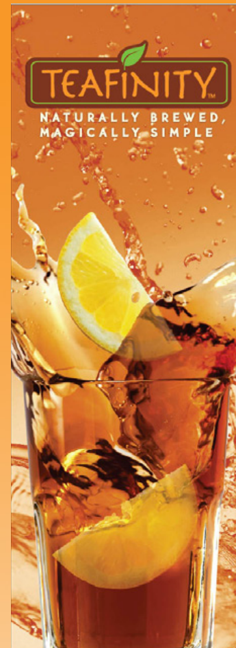
33.25" X 92" BANNER