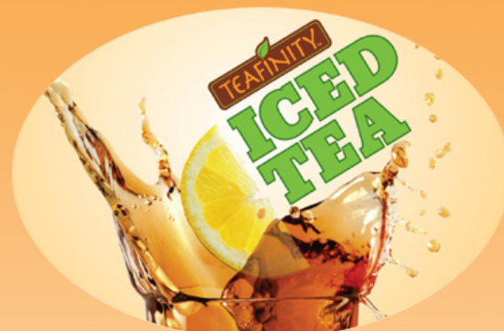
36" X 24" CEILING DANGLER