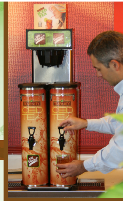
Maintenance is minimal. The product line includes a self-cleaning BIB for sanitization of the equipment lines and all internal parts. This translates into incredibly easy operation.